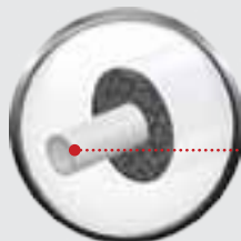
ISOTUBE TC/HT UV with Pex-Al-Pex pipes