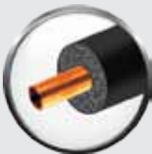
ISOTUBE TC/HT with Copper pipes 6mm - 22mm 1/4" - 3/4"