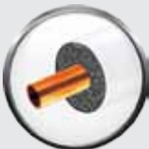
ISOTUBE TC/HT UV with Copper pipes