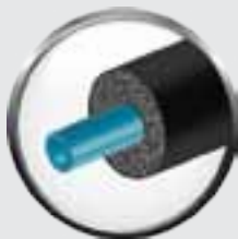
ISOTUBE TC/HT with Polyethylene pipes \Phi 16 - \Phi 22