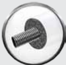
ISOTUBE TC/HT UV with Inox pipes