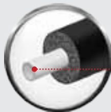
ISOTUBE TC/HT with Pex-Al-Pex pipes \Phi 16 - \Phi 20