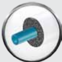
ISOTUBE TC/HT UV with Polyethylene pipes