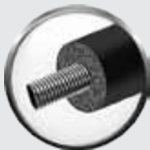
ISOTUBE TC/HT with Inox pipes From \Phi 6 - \Phi 20

3i provides the following pipes with the ISOTUBE pre-insulated solution. Pipes of your choice can also be used.